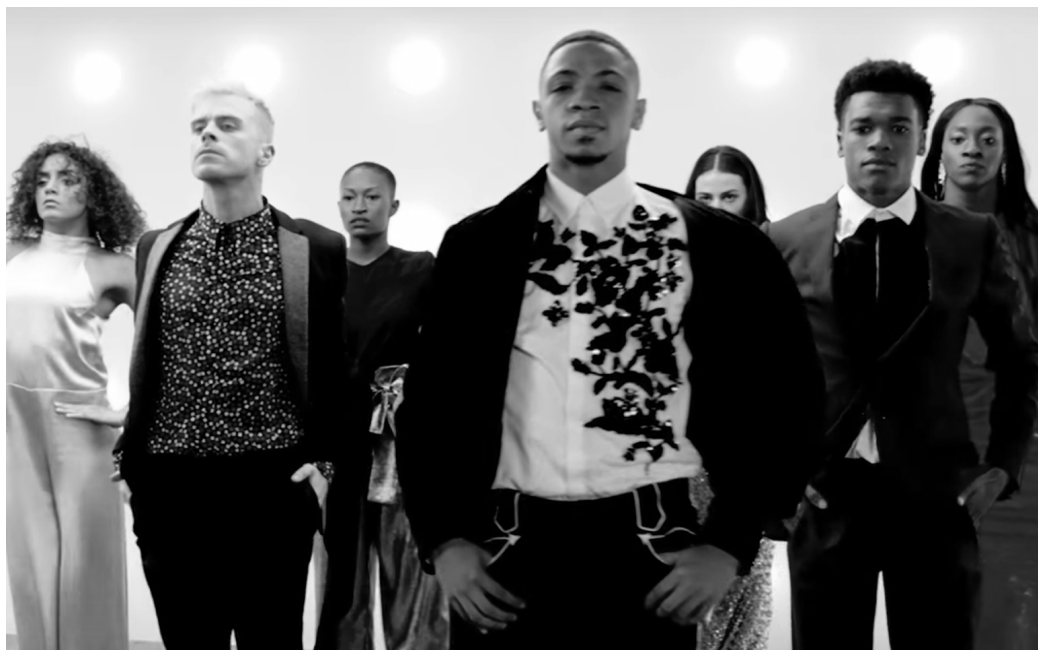
Farfetch presents The Holiday Remix.

In the UK, consumers look forward to holiday commercials in the same way that Americans anticipate Super Bowl ads — and just like the Super Bowl, the stakes for advertisers are ultra-high.